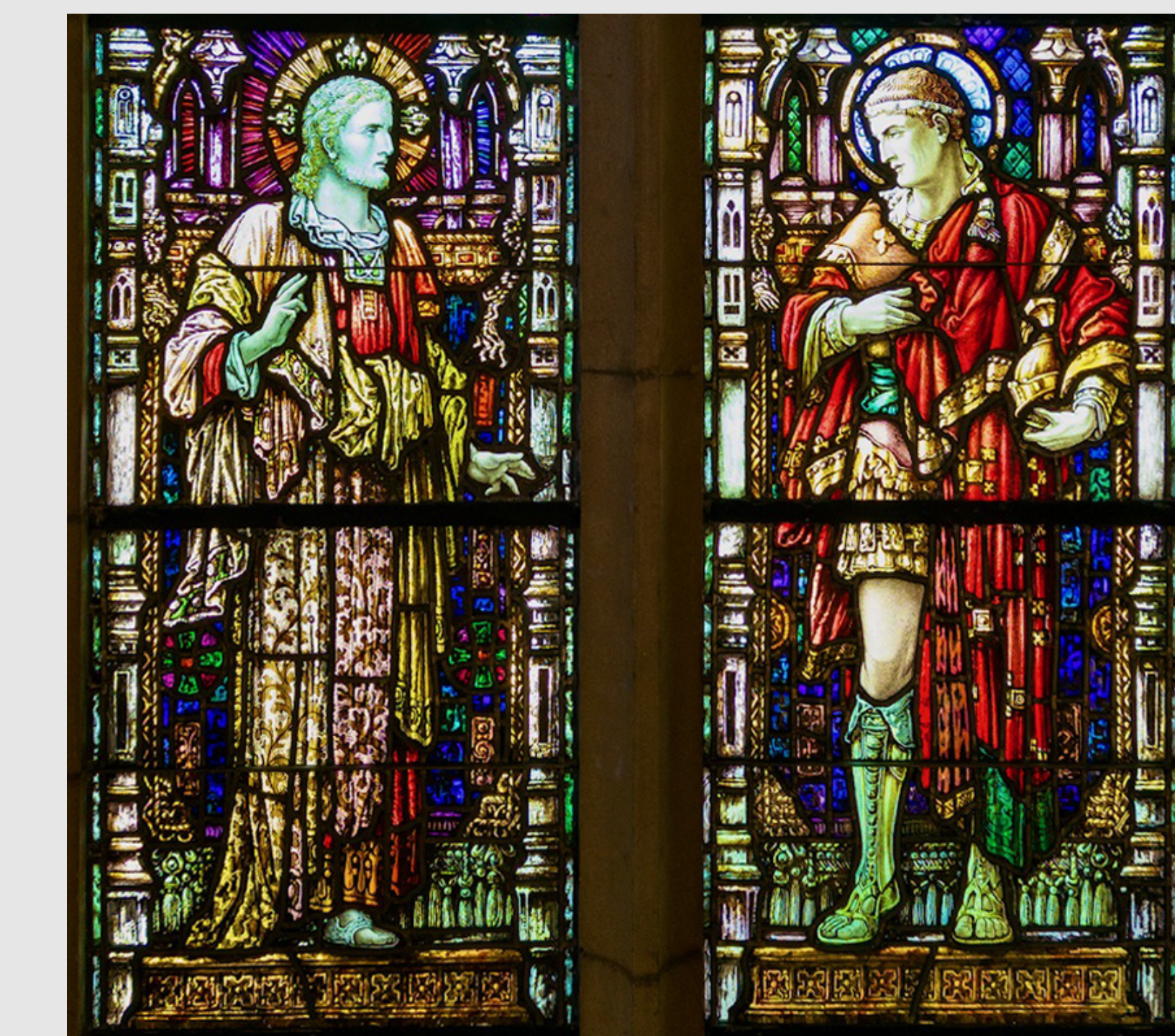
Detail, West window 2, Nobleman's Appeal to Christ for his Son