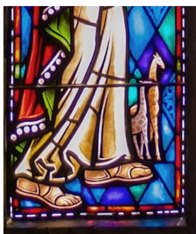
Detail, Clerestory window 1, God as Father

The chronological story of the aisle and clerestory windows begins with the first south windows and moves clockwise through the building. The aisle windows tell the story of the life of Christ, starting with the Annunciation S1 and ending with the crucifixion N4 . The clerestory windows list fundamental figures of our faith's history, starting in the third century and ending in the twentieth.