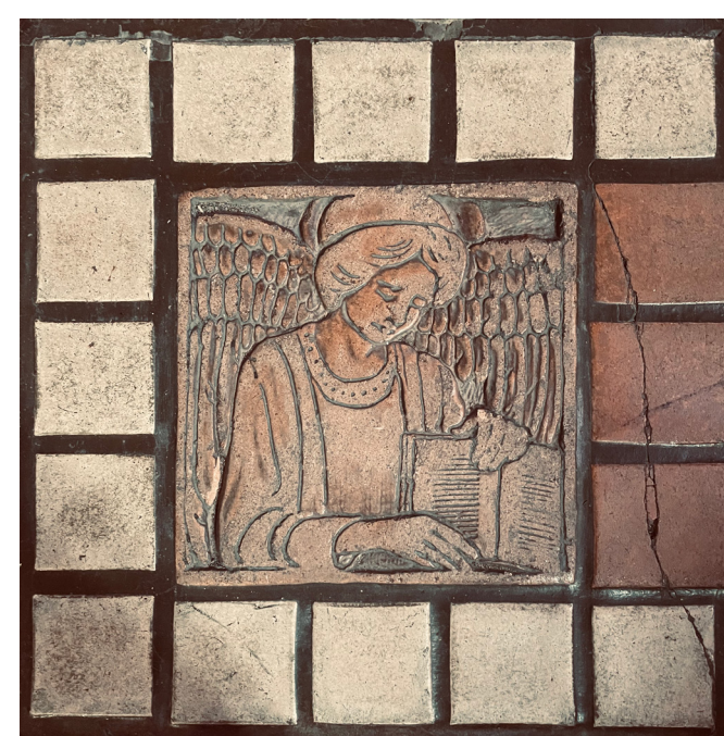
Detail, Chancel tile floor, symbol of Saint Matthew

It is not only in the windows that the beautiful craftsmanship and detail may be found. The chancel area, for example, is paved with exquisite tile by Ernest Batchelder, the preeminent tile maker in Southern California at the time of Trinity's construction in the 1910s. The carved furniture, oak pulpit, and limestone font were created by Ernest H. Grassby of Los Angeles.