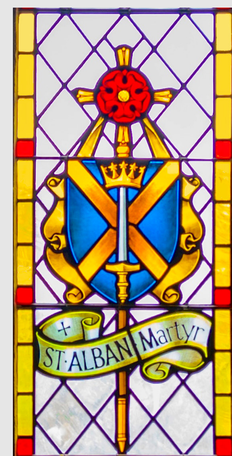
Detail, South High window 1, arms of St. Alban